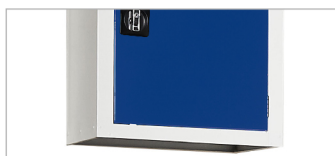
2 x Modular Single Wall Cupboard H700 x W615 x D450mm