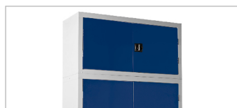
2 x Modular Tall Cupboard - 3 Shelves H2300 x W900 x D600mm