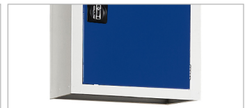
2 x Modular Single Wall Cupboard H700 x W615 x D450mm