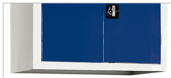
1 x Modular Double Wall Cupboard H700 x W915 x D450mm