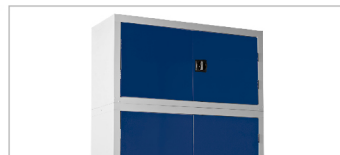
1 x Modular Tall Cupboard - 3 Shelves H2300 x W900 x D600mm