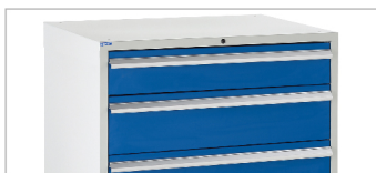
1 x 900 Euroslide Cabinet - 4 Drawers H822 x W900 x D650mm