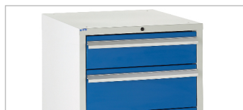
1 x 600 Euroslide Cabinet - 4 Drawers H822 x W600 x D650mm