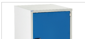
1 x 600 Euroslide Cabinet - Single Cupboard H822 x W600 x D650mm