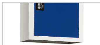
3 x Modular Single Wall Cupboard H700 x W615 x D450mm