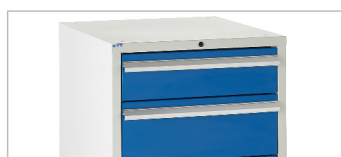
1 x 600 Euroslide Cabinet - 4 Drawers H822 x W600 x D650mm