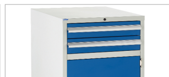
1 x 600 Euroslide Cabinet - Cupboard + 2 Drawers H822 x W600 x D650mm