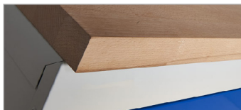
1 x Modular Solid Beech Work Surface W900 x D650 x H40mm