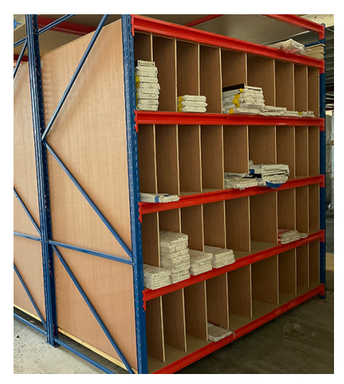
Longspan Shelving Client Installation

Industrial environments such as warehouses, offices. stockrooms and storerooms