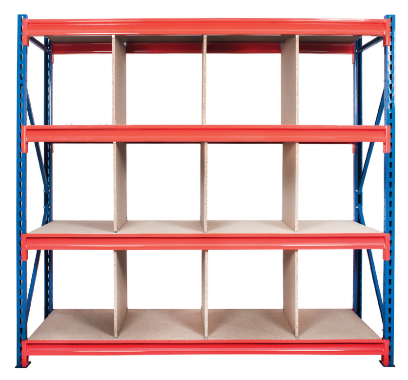
Longspan Shelving with Compartment Storage