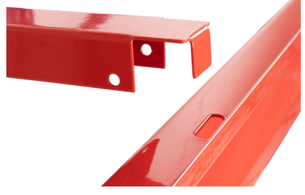
Heavy-duty Deck Supports